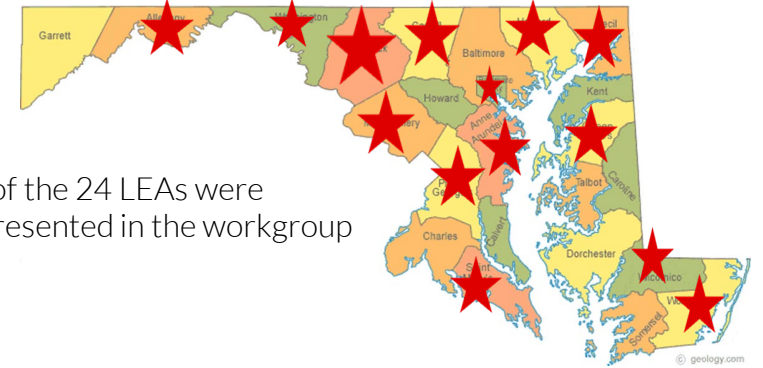
15 of the 24 LEAs were represented in the workgroup